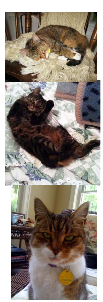
Kitties above from top, Mama, Zeke (asking for a belly rub) and Shelby

Our kitties, Mama, Shelby, and Zeke are all doing great! Here are a few recent pictures of them. We wish all of our friends and family a Happy Hanukah, Merry Christmas and a Happy New Year!